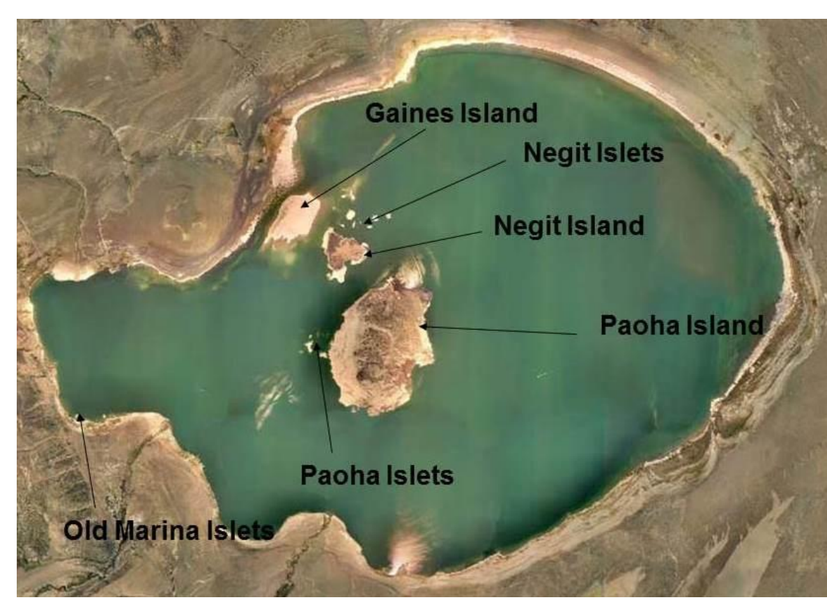
Fig. 1. Locations of islands and islets within Mono Lake.

Mono Lake, California, USA, is located at 38.0° N 119.0° W in the Great Basin of eastern California at an altitude of 1945 m. The lake has a surface area of approximately 223 km<sup>2</sup>, a mean depth of about 20 m, and a maximum depth of about 46 m. As a terminal lake with no outlet, it is high in dissolved chlorides, carbonates, and sulfates, and has a pH of approximately 10.