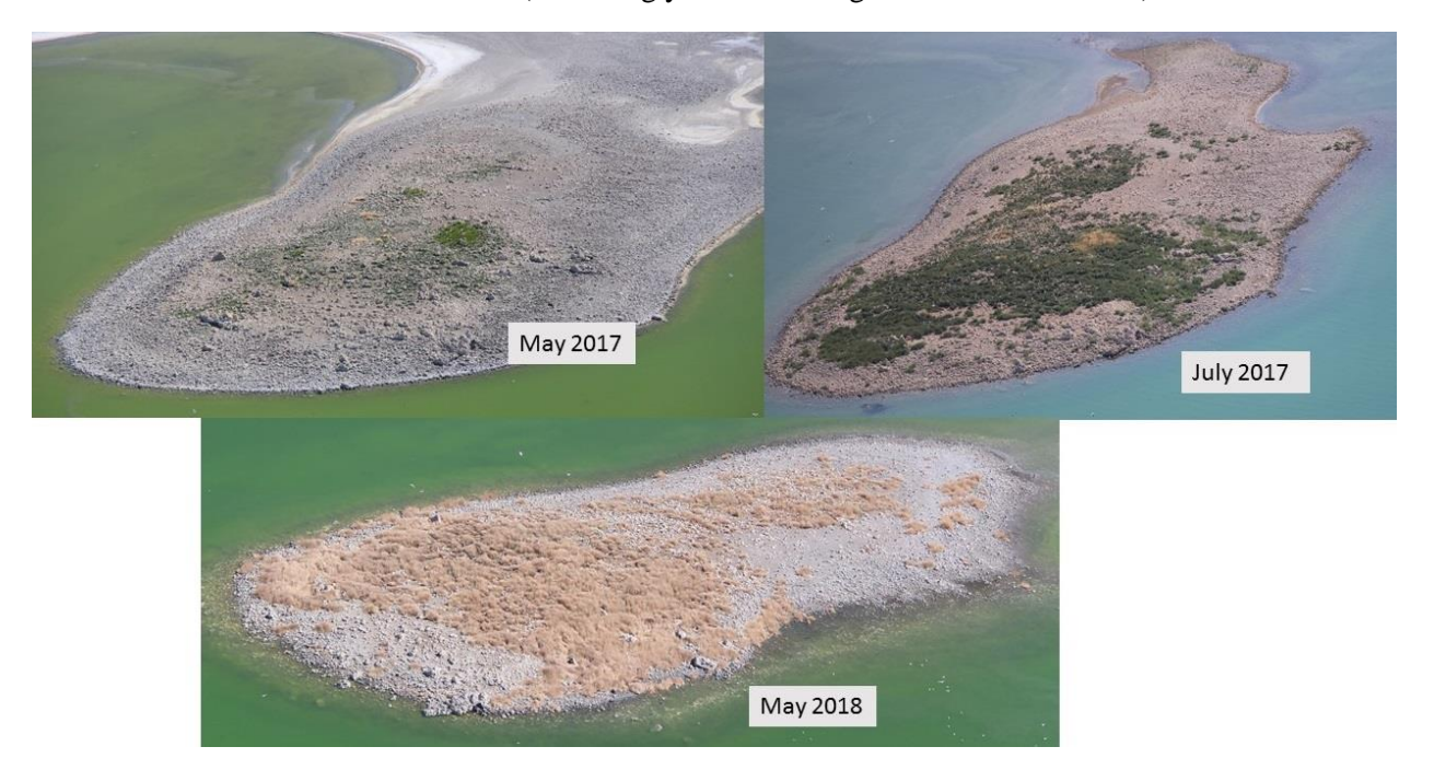
Figure 10. Pancake Islet in May and July 2017, and May 2018. Relatively little Bassia covered the islet when nests were counted in May 2017. Bassia likely overwhelmed hundreds of nests during the 2017 nesting season, and lake level rise may have inundated nests as well. In 2018 Pancake contained the lowest number of nests ever recorded (excluding years following mainland connection).

During chick counts in July and a plot repair visit in September some green Bassia growth was noted, although relatively little compared to what was observed in the fall of 2017. However, I noticed a fair amount of new tumbleweed ( Salsola sp.) growth (fig. 11). I do not recall seeing much if any Salsola on the Negit Islets previously. The plants were large and healthy.