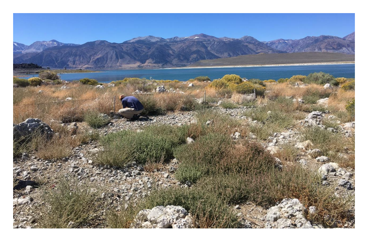
Figure 11. Twain New plot on September 19, 2018. The greenish bushes in foreground are Salsola tumbleweeds. Salsola appears to be a new invasive weed on the Negit Islets. The mostly yellow weeds in the background are Bassia . There are also numerous Rabbitbrush Ericameria bushes in bloom.

Other Factors Affecting Population Size in 2018