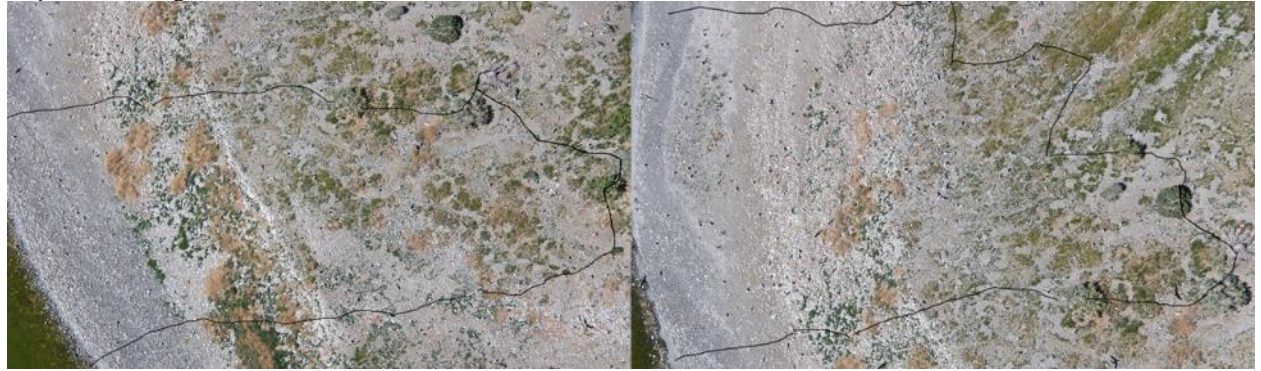
Figure 4. Example of images used for counting with drawn boundary lines. The top line on the left image matches the lower boundary line on the right image. Other boundary lines match on adjacent images.

Counting Nests from Aerial Images: I selected images for counting based on clarity and by area captured. The images I chose contained overlapping zones with adjacent images, covering the entire islet. I then used Adobe Photoshop to draw boundary lines on each image with the Brush Tool. In overlapping zones, I drew corresponding boundary lines following matching landmarks between the two images (i.e. rocks, vegetation, etc.). In some cases individual nests were woven around to ensure the boundary lines matched exactly (figure 4). This year for Twain Islet I selected images of lesser resolution that those used in 2016 and 2017, but that covered larger land areas. I did so to lessen the amount of image "stitching", which is a very time-consuming task. The Twain images I chose covered a larger area, but still contained enough detail that bird posture (i.e. sitting or standing) was generally easy to differentiate (e.g. fig. 5).