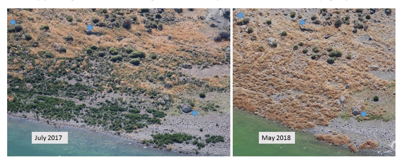
Figure 9. West shore of Twain Islet in July 2017 and May 2018. Blue stars indicate matching landmarks. Note how the green Bassia "filled in" by spring of 2018. The lack of green germination and generally matching growth pattern on the landscape indicates little germination occurred in early spring 2018.

Nesting distribution among the islets in 2018 was generally similar to 2017 with the exception that the number of nests on Pancake Islet dropped sharply, the number of nests on Coyote Islet dropped somewhat, and the proportion nesting on Twain was relatively high. The decline on Pancake is expected given the significant reduction in nest site availability due to Bassia growth and the lake level rise that occurred between May 2017 and May 2018 (fig. 10). The drop on Coyote is more difficult to interpret. In 2017 I recorded a relative jump in nest numbers on Coyote which I attributed to its lack of Bassia . However this year the proportion of the gull population nesting on the Paoha Islets dropped to tie the lowest proportion measured. Part of that is because Piglet Islet, which formally contained large numbers of nests, has been abandoned since 2014 following Coyote depredation and connection to Paoha Island (fig. 3). Due to the rising lake level last summer, Piglet again became an islet, although no gulls nested there in