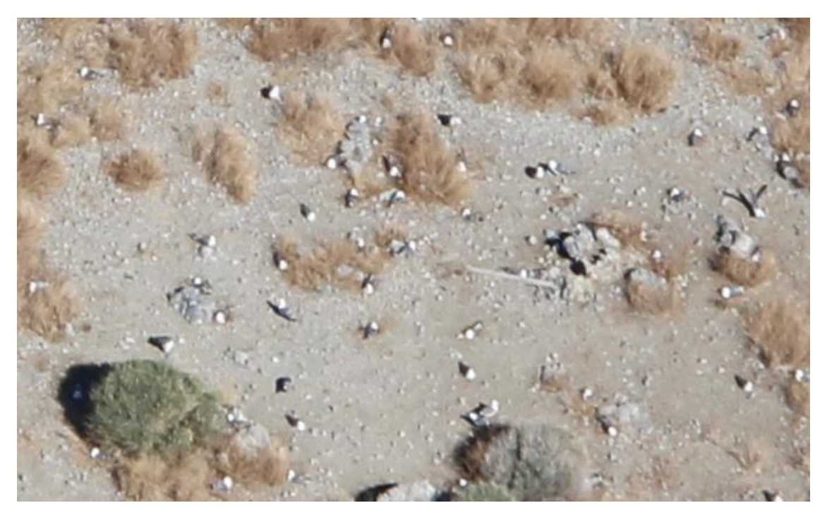
Figure 5. Sample of a cropped image used on Twain Islet for counting gulls showing lesser resolution detail than in many of the 2017 images. Image would be zoomed in further to count.

For counting, most images were enlarged to 200% of the original resolution (this varied between 150 – 300%), and each image was systematically scanned side to side or up and down in passes, and gulls were marked with the Count Tool to their corresponding count group. Following this process, the entire image was scanned again for any missed gulls. Gulls are remarkably camouflaged against the Negit Islet topography. Images need to be carefully scrutinized to obtain an accurate count. The bright white heads,