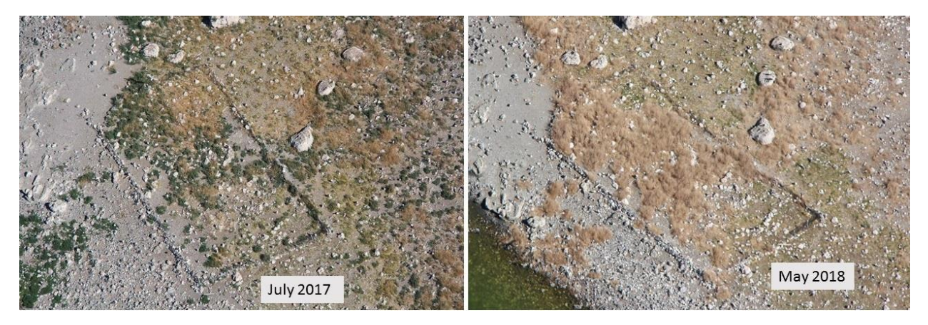
Figure 8. Twain South plot in July 2017 (left) and May 2018 (right). Little or no new, green Bassia growth is seen, although the dead plant carcasses from 2017 greatly reduced nest site availability.

In 2018 Bassia growth slowed and germination rates were much lower than they were in 2016 and 2017. Aerial photos taken in May 2016, May 2017, and July 2017 showed abundant Bassia germination as bright green growth. But the May 2018 aerial photos showed little to no green growth indicating little or no spring germination. In general the pattern of Bassia growth on photos of the Negit Islets taken in May 2018 was similar to aerial photos taken in July 2017 except that the Bassia had expanded somewhat and "filled out", but was yellow and dead (figs. 8, 9). Although relatively little new Bassia grew in 2018, the dead plants from previous years continued to provide a barrier for nesting. While counting nests from the aerial photos, I did not observe any gulls nesting in/on dense Bassia patches.