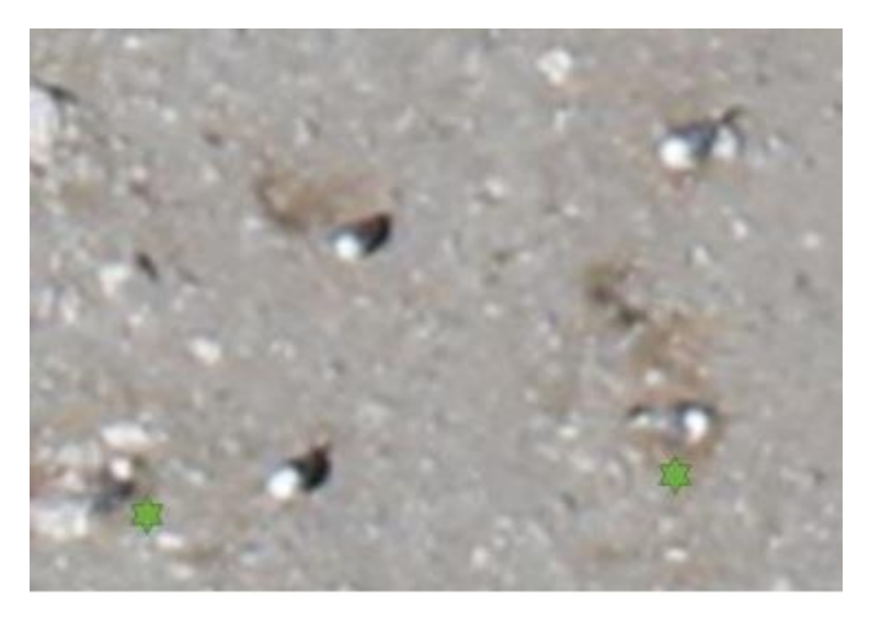
Figure 6. Sample of standing and incubating postures on a photo with poor resolution. The birds marked with green stars are considered incubating. The remaining birds are standing: their bodies are angled upwards and their white breasts show more prominently than the gray backs.

Determining whether a gull is standing or incubating can be a challenge with some images, and develops with experience. Over the past several years I have counted thousands of gulls from images, and have been able to ground truth my aerial photobased plot-counts with ground-count tallies of nests within the plots. Useful characters I associate with standing birds is that their bodies are angled upwards and the white circles of their breast show prominently. Incubating birds are often nestled down in nests with their gray backs showing prominently (fig. 6).