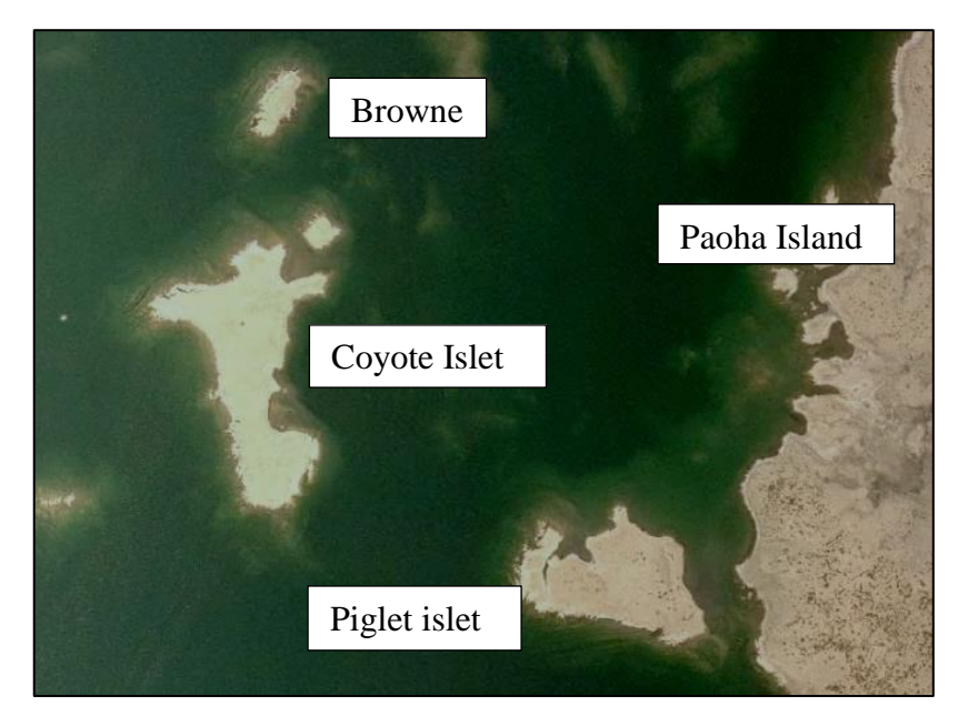
Fig. 3. The Paoha Islet complex.

Fig. 2. View of the nesting islets within the Negit Islet complex.